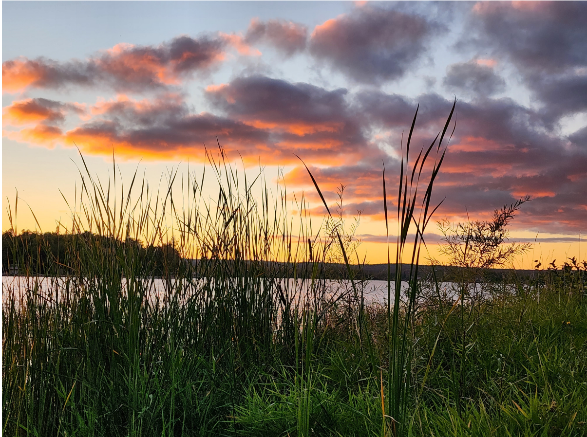
of Lake Metigoshe at Northern Lights Camp in North Dakota.