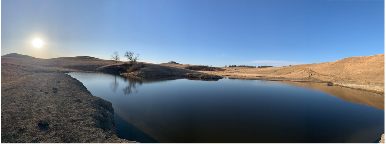
north of Dakota Adventist Academy in Burleigh County, North Dakota.